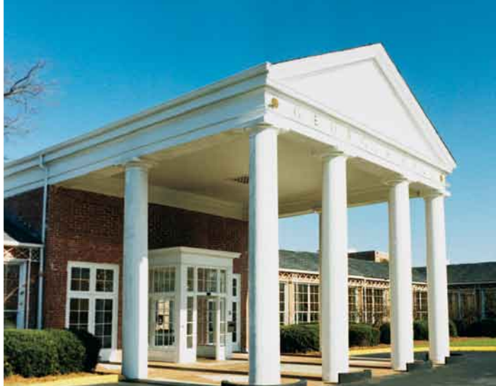
Roosevelt Warm Springs, Warm Springs, Ga.