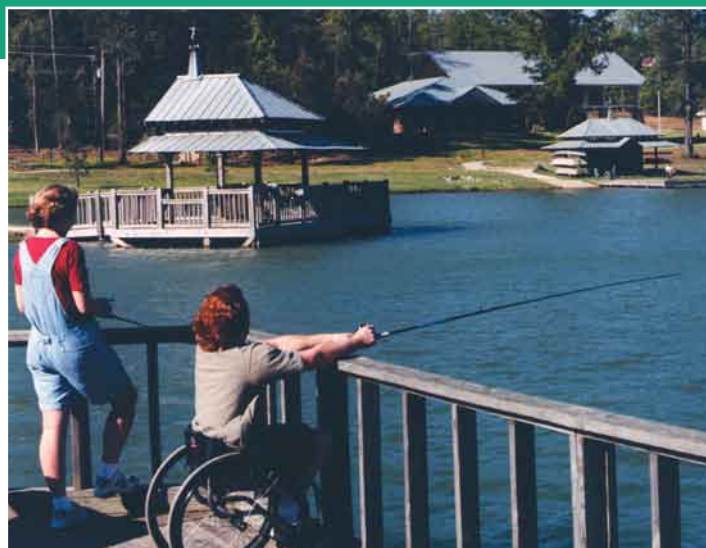
Fishing at Roosevelt Warm Springs