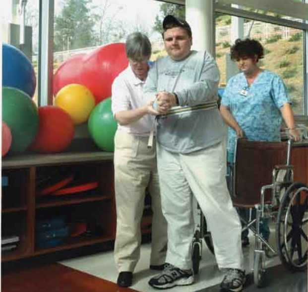
A patient receiving therapy