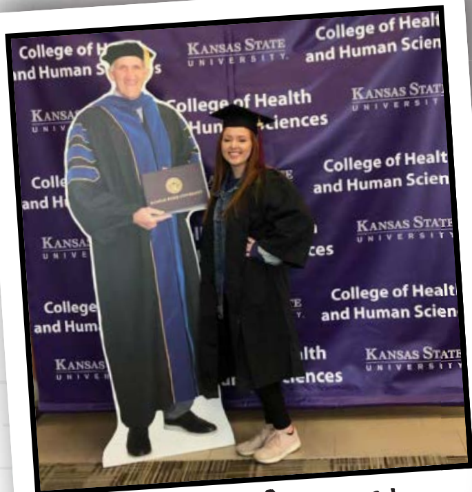
Class of 2020!