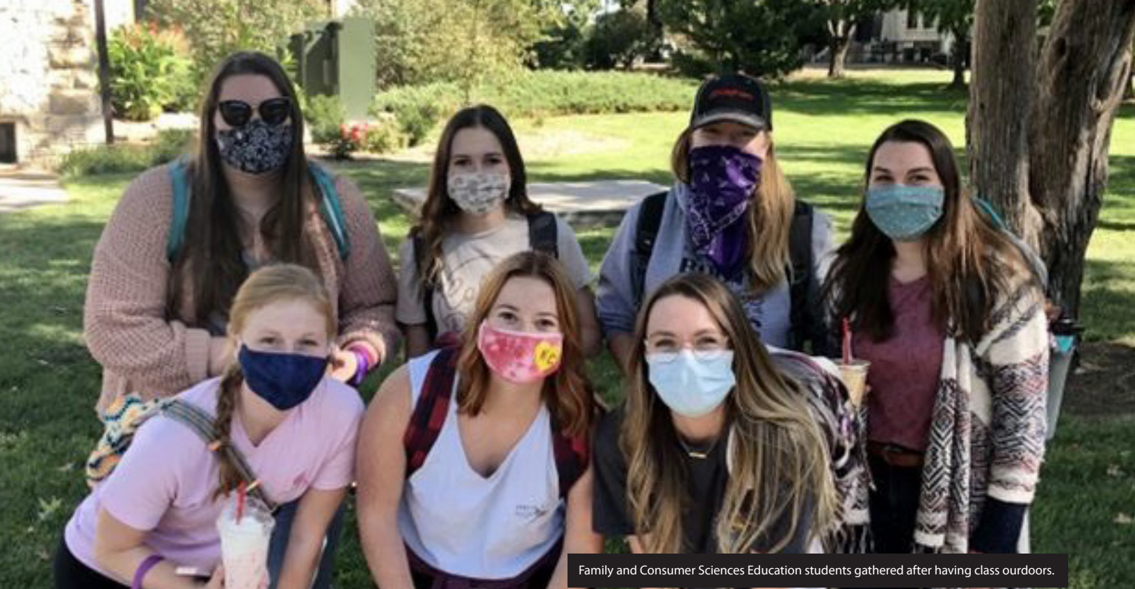
Family and Consumer Sciences Education students gathered after having class outdoors.