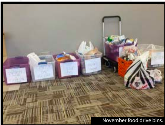
November food drive bins.

In November, the ambassadors hosted a food drive for Cats' Cupboard. This food drive replaced the college's normal December event that coincides with the faculty/staff holiday party. Departments asked students, faculty and staff to contribute to their department bins. Those who contributed were entered into a drawing for free lunch at Lacy's Fresh Fare & Catering. At the end of November, the college donated 504 items to the Cats' Cupboard to support students and staff facing food insecurity.