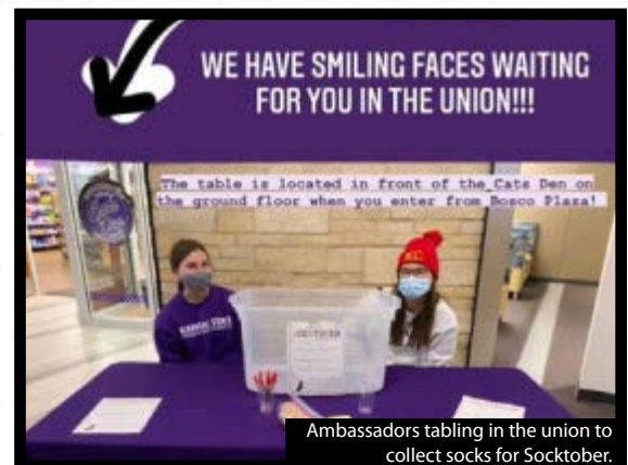
Ambassadors tabling in the union to collect socks for Socktober.