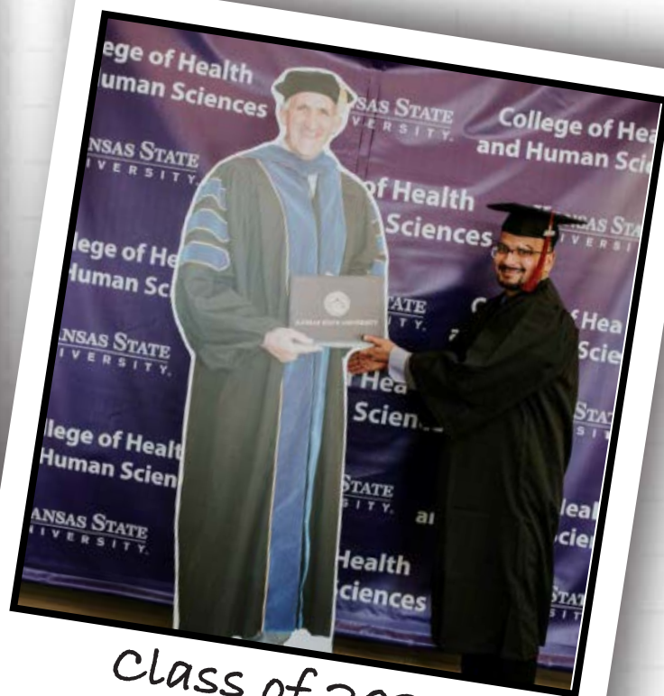
Class of 2020!