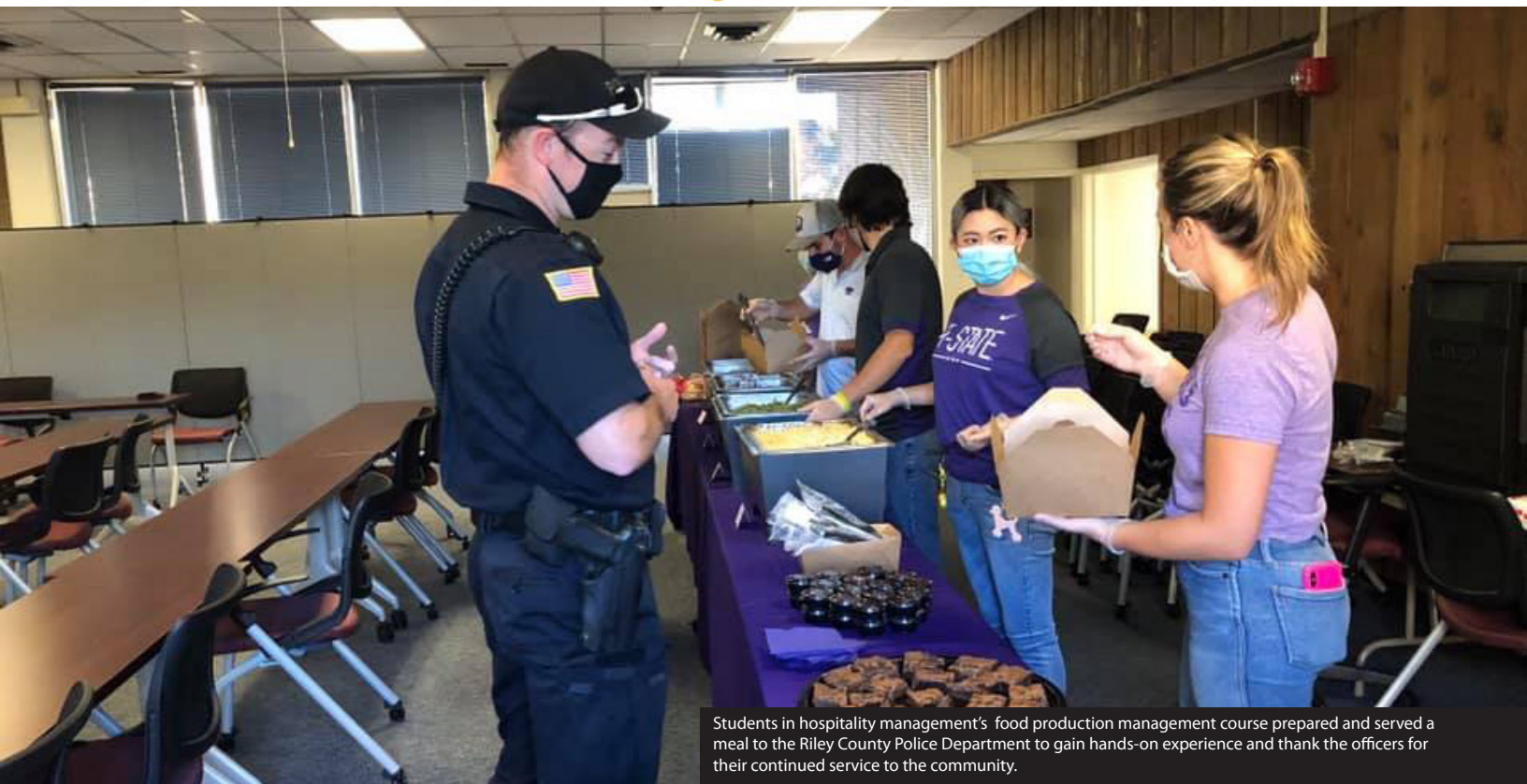
Students in hospitality management's food production management course prepared and served a meal to the Riley County Police Department to gain hands-on experience and thank the officers for their continued service to the community.