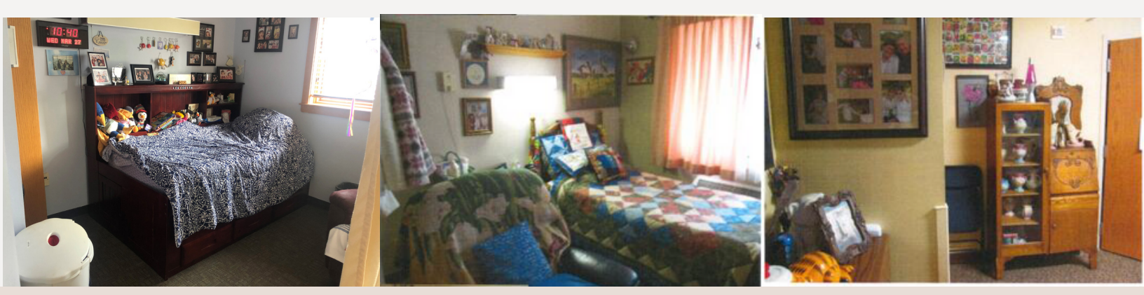
INSERT HOME ADDRESS AND CONTACT INFFORMATION HERE