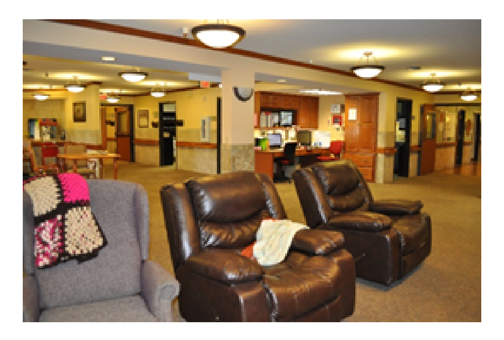
FORMER LARGE LIVING AREA CONVERTED INTO A DINING, LIVING, AND STAFF WORK AREA.