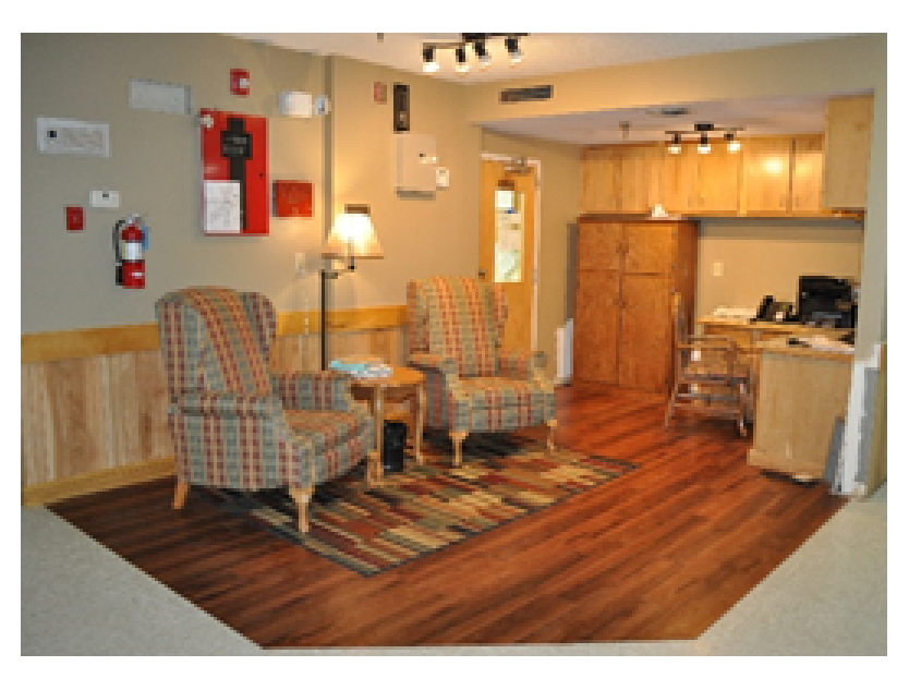
STAFF WORK AREA AND LIVING SPACE WHERE THE FORMER LARGE NURSE'S STATION WAS LOCATED