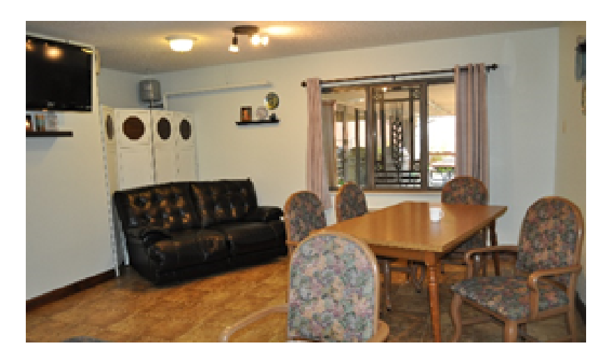
RESIDENT ROOM CONVERTED TO A RESIDENT LIVING AREA