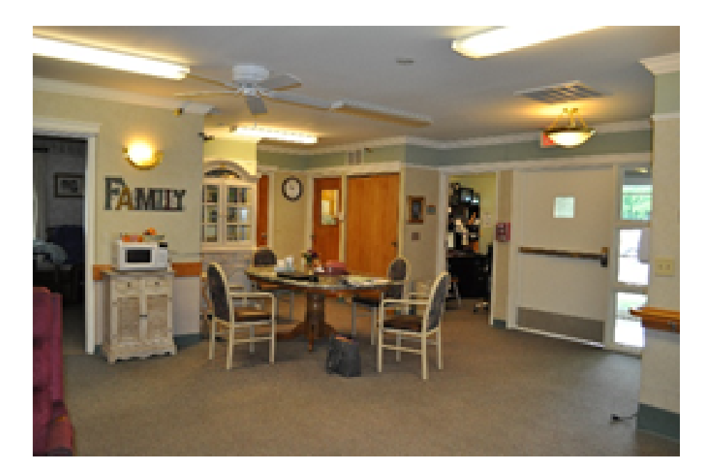
SMALLER LIVING AND HANG OUT AREA IN ONE OF THE WORK AREAS.